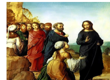
I BEG YOU, HEAL MY DAUGHTER

In the Gospel story today, it would seem that Jesus' understanding of his mission is expanded by his encounter with the Canaanite woman. He is the Son of God, yet he is moved here from unresponsiveness, to resistance, and finally to realization that his work is bigger than even He had realised. In this moment it is made clear to him that he is not sent "only to the lost sheep of the House of Israel?" It would be assumed that the Canaanite woman is unbelieving but she has a profound faith in Jesus, so much so that she is prepared to press her case. She is prepared to accept the even the "scraps that fall from the table" —that will be enough to have her daughter healed.